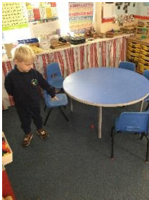
Under the table

is a circle because it has 1 curved side and no corners". They have been finding these shapes in the environment. In addition to this the children been learning and using positional language to describe where a little teddy is hiding.