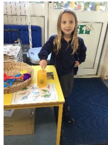
Under the cup