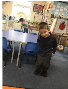
Behind the chair