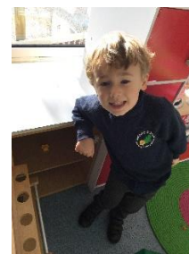
In the cupboard

This week the children have been learning about counting, subitising and the compositions of number 4 and 5. They have used lots of practical activities and also watched some number blocks to support thier learning.