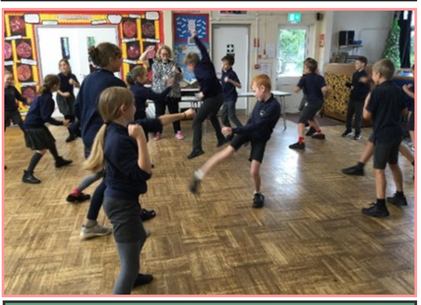
We also practised our jumping. The children had to measure how far they jumped with the Halteres compared to jumping without. Halteres were hand-held 'dumbbells' made out of stone or metal. The weight was intended to give impetus when jumping and does seem to help you jump further.

The children began by talking about the origin of the Olympic Games and how it has developed to the present day. They took part in some of the original events, including running, jumping and wrestling!