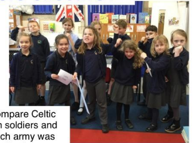
LI: I can compare Celtic and Roman soldiers and decide which army was more effective