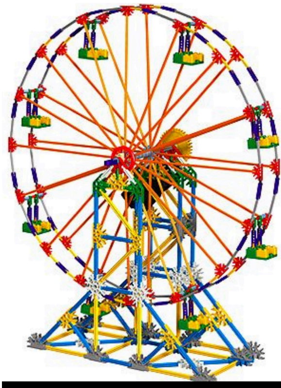
The London Eye made from K'Nex