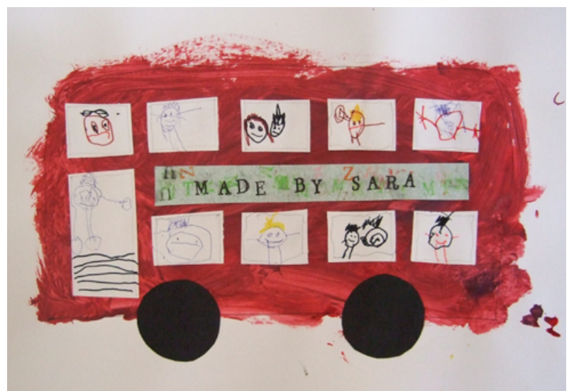
London Bus – paint and collage