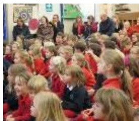
The children loved it and it was great to welcome the parents.